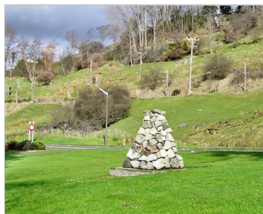
Waymark - Tamatea Pokai Whenua cairn, Taihape

Mokai Patea Claims Trust PO Box 54 Taihape Tel: 06 http://www.mokaipateaclaims.maori.nz/ Facebook