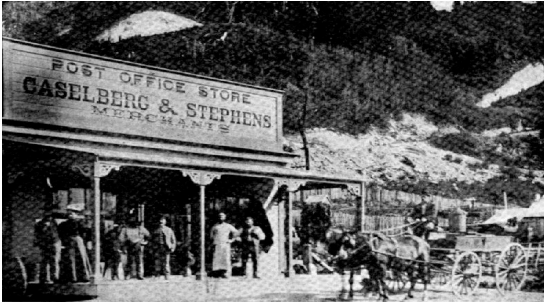
Merchant store, Caselberg and Stephens. Mangaweka